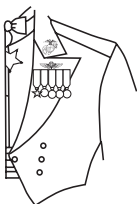
Evening Dress Jacket (Male SNCO’s)